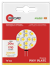
PLATE 2 W