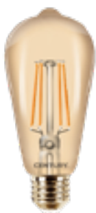
Ø64 x 140 40 g