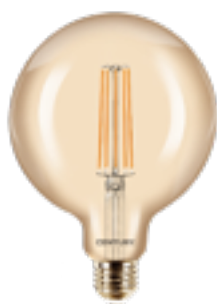
Ø125 x 170 100 g