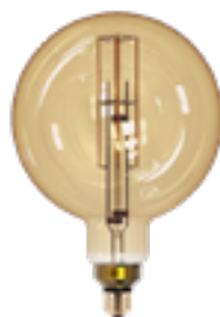
Ø200 x 300 366 g