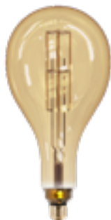
Ø160 x 320 265 g